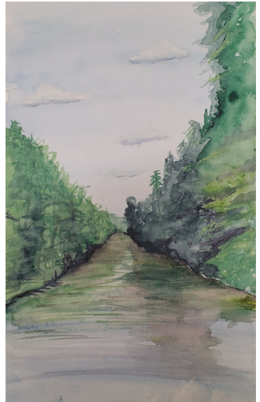
Solitude Watercolor on paper Created by Tiffany Blease

A: Besides art, I love to go kayaking in the warm months and be outside when I can. I also love to do yoga, venture and discover new places and read.