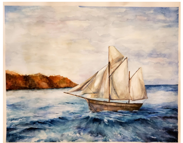
Transitions Watercolor & Gouache on cold pressed paper Summer 2019 Created by Jaclyn Hofstetter