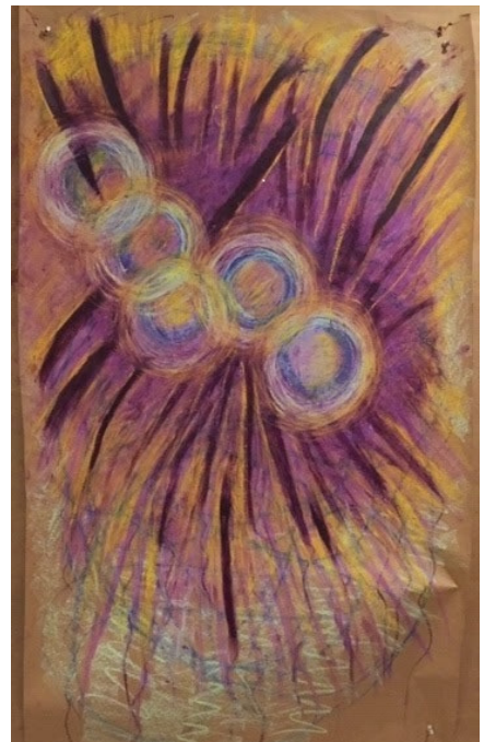
Great Shout of Joy oil pastel & oil stick on kraft paper August 2020 Created by Heather Leigh