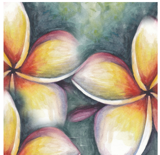
For Mom Watercolor & digitally altered image on paper Created by Tiffany Blease