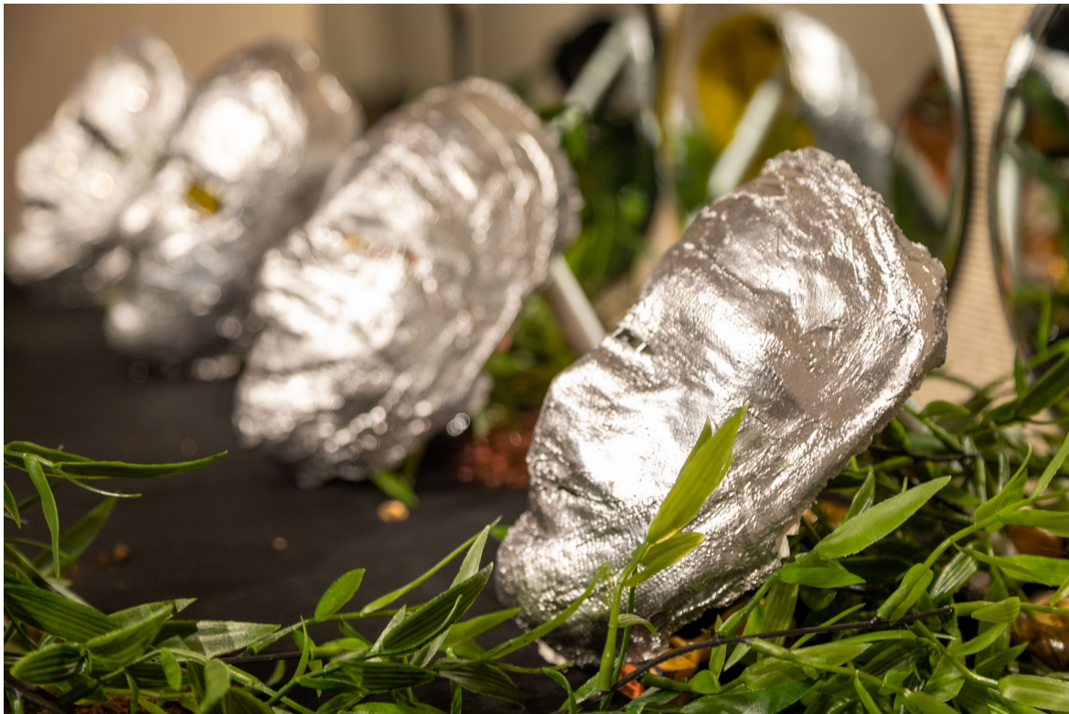
Artwork by Amelia DePrez