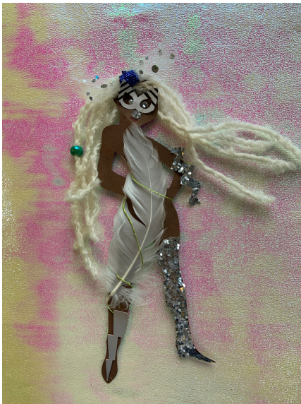
Example of a finished Brush Box super hero