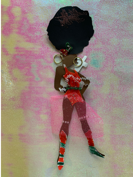
Example of a finished Brush Box super hero