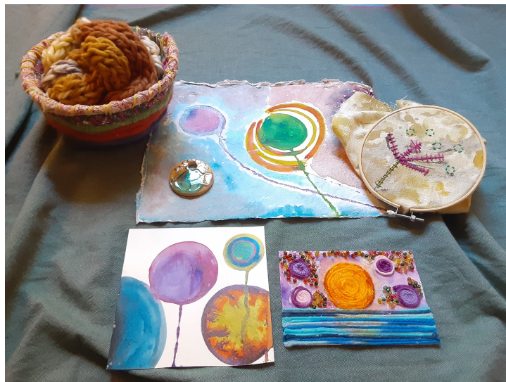
Fibers, Watercolor, & Clay: A Mixed Media Buffet (2019-2020)