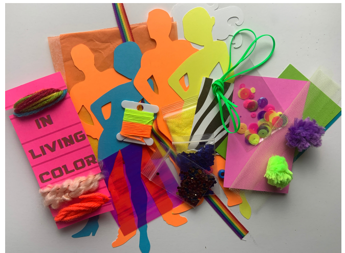
Contents of one Brush Box