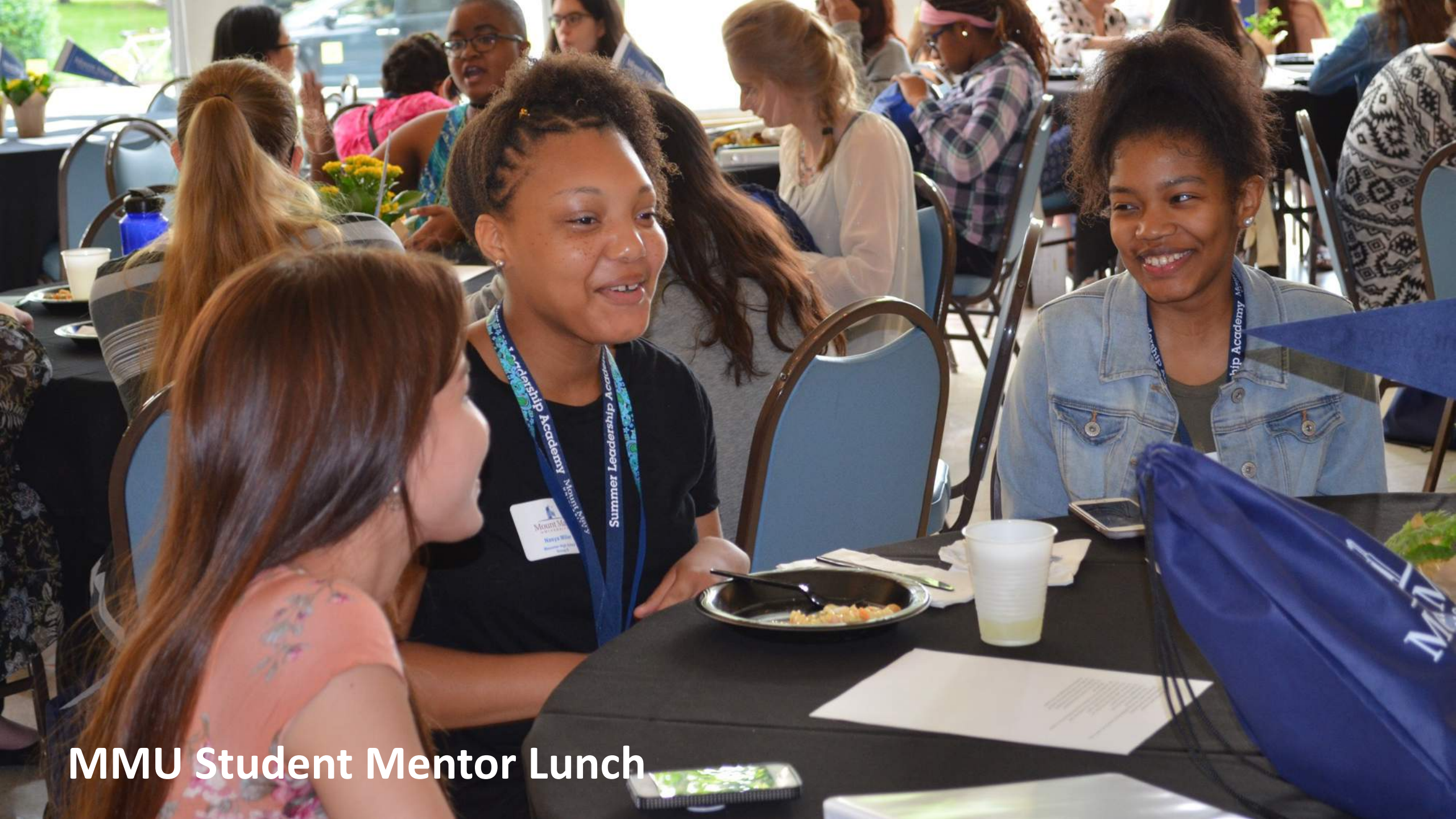
MMU Student Mentor Lunch